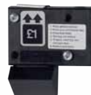
Coin/Token Operated Lock